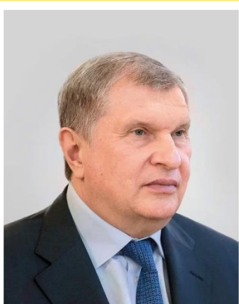
Igor Ivanovich Sechin Chairman of the Management Board, Chief Executive Officer of Rosneft Oil Company

“Speaking about energy security over the long term, it should not be left unmentioned that Russia is one of the few countries giving priority to investments in new energy projects... With the world's investments in exploration and production shrinking, this greenfield project of global significance in North Siberia (Vostok Oil) with a resource base of 6.5 billion tonnes of oil is probably the world's largest project that can have a stabilizing effect on the entire hydrocarbon market”.